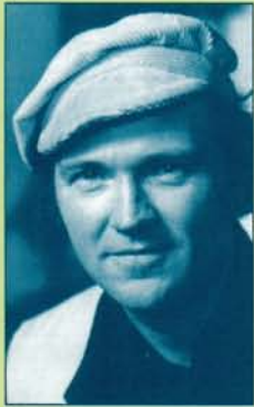
Liam Clancy July 16th, 8pm Musician £8 / £6 concession

One of Ireland's most well loved folk entertainers will make his debut at the arts centre as part of the Spraoi Laoise Festival , the festival for over 50's, but his music and storytelling is well suited to all ages. His collaboration with his brothers and Tommy Macken brought him to a world wide audience with such hit records as The Band played Waltzing Matilda and The Dutchman . He has more recently worked with Phil Coulter, most memorably with the single Home from the Sea .