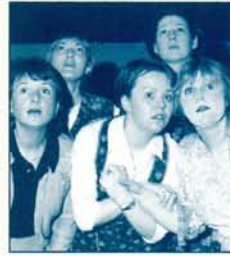
Dancing at Lughnasa July 23rd & 24th, Brian Friel £7 / £5 concession, 8pm

More Spraoi fun with a Céilí Mór and Concert featuring The Half Door Club , Camross Ceoltas Ceoltoirí and a mystery guest playing old time favourites, which promises to be a great night of fun and nostalgia. It will also be the first opportunity to experience a performance in the arts centre with the seating rake retracted, allowing patrons to dance on the beautiful oak floor.