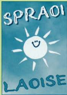
Céilí Mór July 17th, 8pm Old Time Dancing £4

'I don't think I can think of a better ballad singer than him.' Bob Dylan